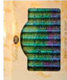
SH12-G Sunrise Green $12.00 Item M