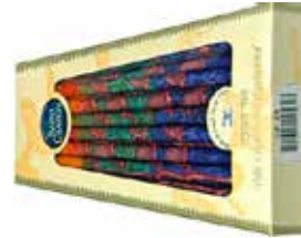
CP23 Orange & Purple $13.00 Item C