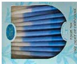
CP14 Blue & White $9.00 Item A