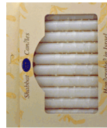
SH12-W Snow White $11.00 Item P