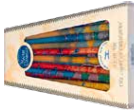
CP30 Multicolor $13.00 Item D