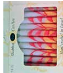
SH12-TRR Red/Orange on White $12.00 Item O