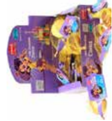
LBCA60 Milk Chocolate Coins Box of 24 Mesh Bags $17.00 Item Q