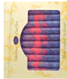
SH12-P Sunrise Purple $12.00 Item K