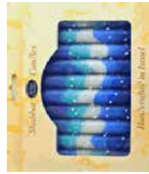
SH12-SNB Blue/White with Snow $12.00 Item L