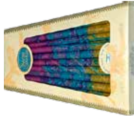
CP22 Lavender & Green $13.00 Item B