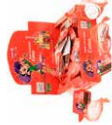
LBCA61 Dark Chocolate Coins Box of 24 Mesh Bags $17.00 Item R