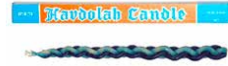
H1R Round Braided 4-wick Blue & White 11" $5.00 Item I

Created by Ner Zion Candles in Beer Sheva