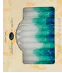
SH12-T Blue/Teal Gradient $12.00 Item N