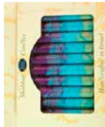
SH12-HRV Harmony Violet $12.00 Item J