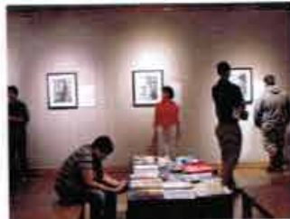
Visitors enjoyed the reference books on loan from the Temple Beth Israel in Harlingen.