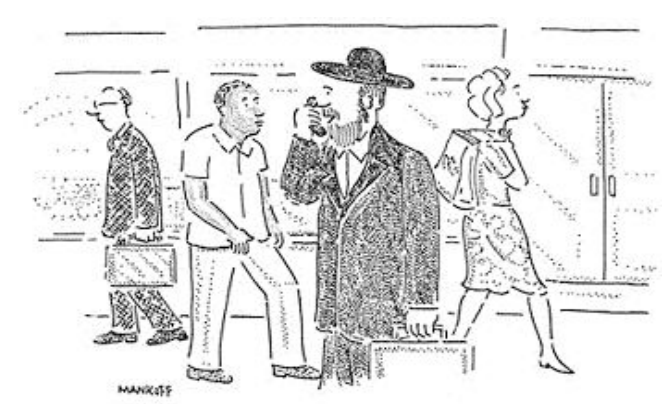
"And remember, if you need anything I'm available 24/6."