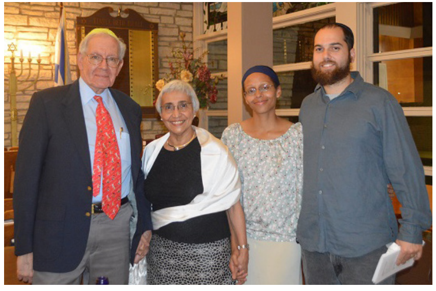
CONTINUED ON PAGE 4